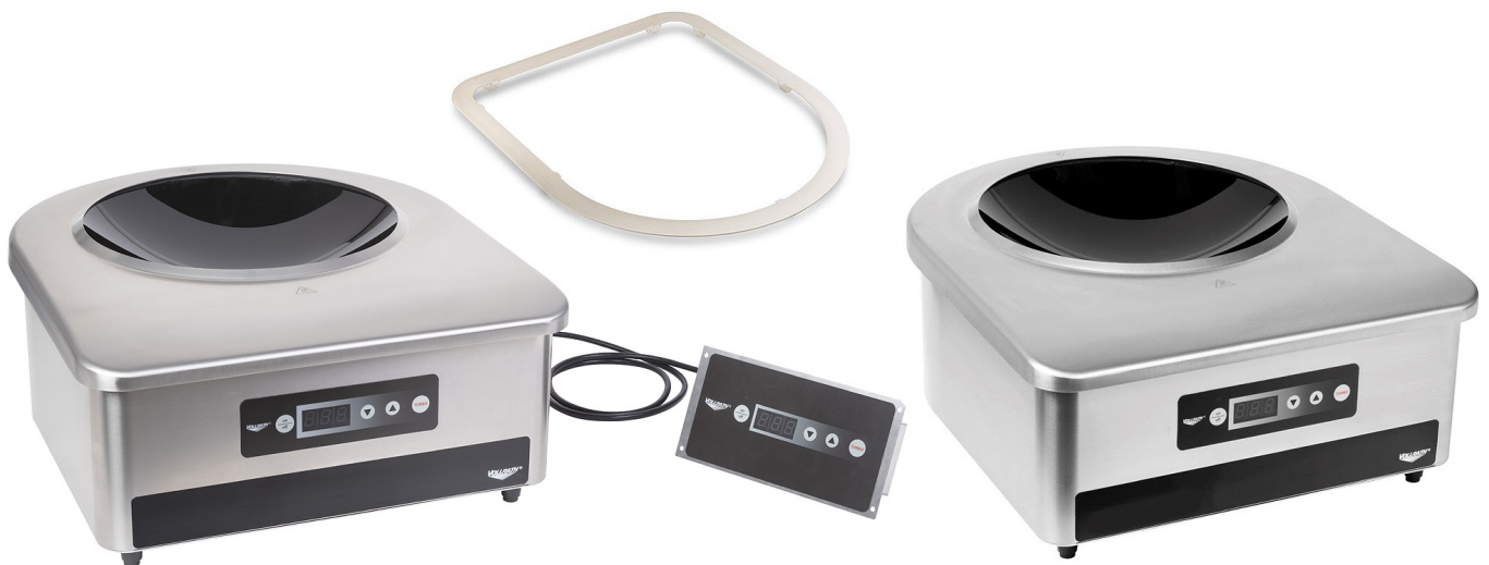
Drop-In Model shown with accessory kit - purchase separately.