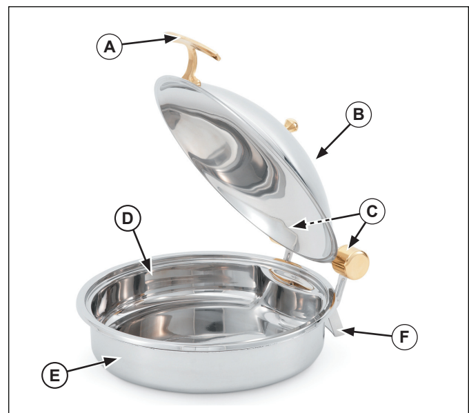
Figure 1. Chafer Features and Controls.