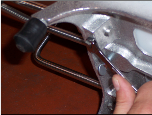
Figure 3. Pusher Head Adjustment Through the Blades.