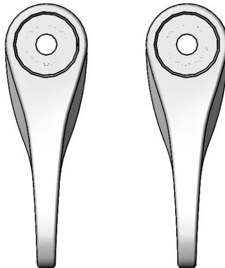
001638-45NS-AM Anti-Microbial Coated Lever Handle (2) Supplied

Product Specifications: Anti-Microbial Coated Lever Handle Parts Kit