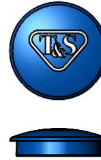
018506-19NS Blue Handle Index (1) Supplied