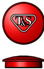
001193-19NS Red Handle Index (1) Supplied