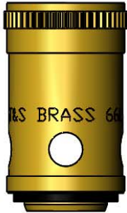
000788-20 Removable Eterna Insert-Right Hand w/ Gasket (Qty 1)

001098-45 (New Style) Eterna Spindle Packing Seal [Replaces 001063-45, 001098-45 (Old Style) & 009745-45] (Qty 6)