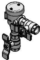
B-0963 Continuous Pressure Vacuum Breaker Qty. = 1 ea.