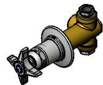
0RK2 Shutoff / Control Valve w/ Adjustable Wall Flange Qty. = 1 ea.