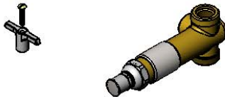
B-1027-UCP Concealed Straight Loose Key Valve w/ Tee Handle & Mounting Screw Qty. = 2 ea.