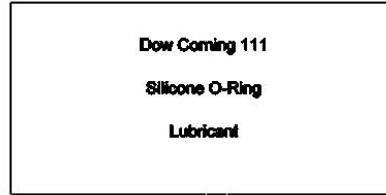
DC-111 SILICONE GREASE(1)