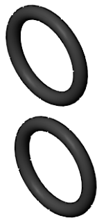
(2) Heat Resistant O-Rings