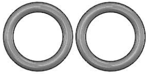
Spring Body Seal Qty 2