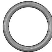
Valve O-Ring Qty 1