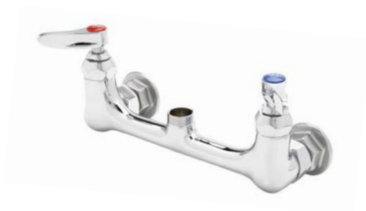
B-0330-LN Double Pantry 8" Wall-Mount Base Faucet Less Nozzle