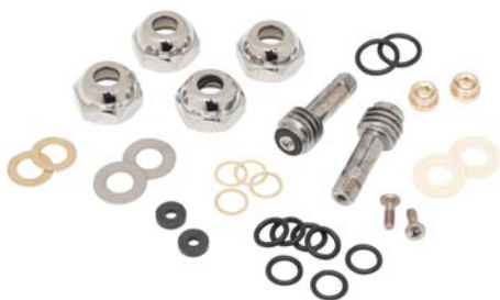
B-20K Parts Kit