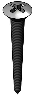
#12 Type A Phillips Head Fully Threaded Screw