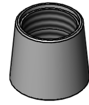
Finish: Polished Chrome