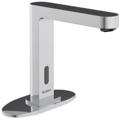
SF-2900 Deck Mount, Hardwired SF-2950 Deck Mount, Battery Powered