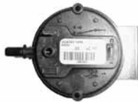
Figure 1 Pressure Switch

WARNING: The instructions in this sheet are designed to prepare a heater for high altitude operation prior to installation. If your heater is installed, for your safety, turn off the gas and electric before servicing.