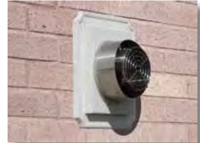
Compact, Aesthetic Concentric Vent/Combustion Air Horizontal Vent Kit