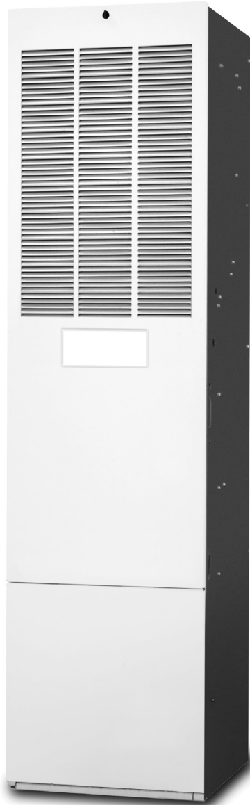
Front Return with Coil Box

MG2S DOWNFLOW TWO STAGE CONDENSING GAS FURNACE 96+% AFUE