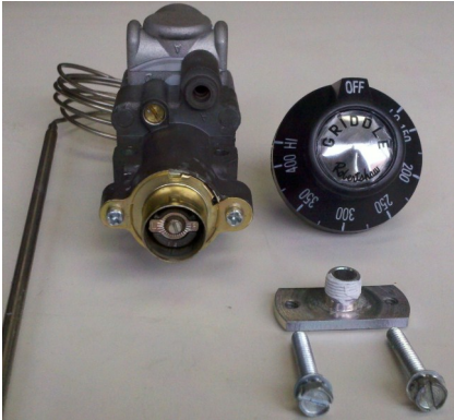
Figure 11. Fry Top Thermostat

The model BJ Robertshaw is a combination thermostat and gas valve. The gas is turned on and the temperature setting made by a single rotation of the dial. This valve automatically locks itself in the OFF position. To use, push dial inward, rotate counter-clockwise to the desired temperature. To shut gas off, rotate clockwise to OFF position.