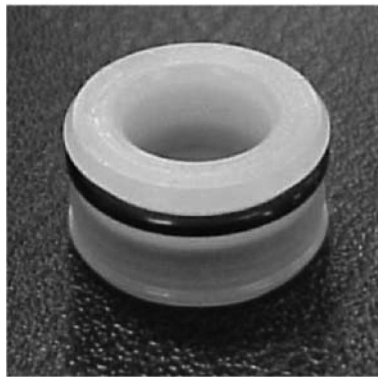
Lip Seal To Be Replaced.

NOTE: This kit will obsolete Shaft Seal P/N 620701121 and Auger Motor P/N 620305201. This kit is intended for replacement of obsolete lip seal. This kit requires removal of existing lower housing, seal, and auger motor.