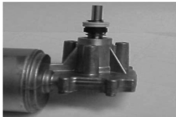
Super Seal Assembly.