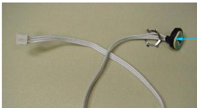
Jar Sensor 990084400