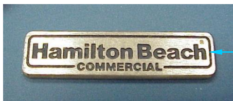
Hamilton Beach Commercial Badge 990092700

PROPRIETARY RIGHTS NOTICE This document and all information contained within it is the property of Hamilton Beach Brands, Inc. (HBB). It is confidential and proprietary and has been provided to you for a limited purpose. It must be returned or destroyed upon request. Disclosure, reproduction or use of this document and any information contained within it, in full or in part, for any purpose is forbidden without the prior written consent of HBB. No photographs may be taken of any article fabricated or assembled from this document without the prior written consent of HBB.