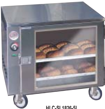
HLC-SL1826-5L Shown with optional accessory Lexan Door.

The work-saving answer for Institutions, Cafeterias, Buffets, Catering and Fast Food.