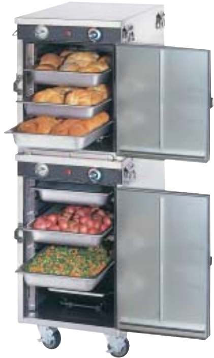
HLC-5S Stacked on an HLC-8