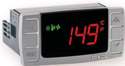
Figure 4 = display layout

When power is first turned on all LED's and display segments light. After the control initializes, the green thermometer bulb blinks. When the heating element is turned on the green thermometer bulb symbol stops blinking. It completely turns off when the temperature set point is reached and the heating element is turned off. This cycle continues to maintain the box temperature while actual box temperature is displayed.