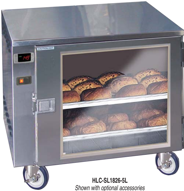
HLC-SL1826-5L Shown with optional accessories Lexan Door and Dixell Controller.