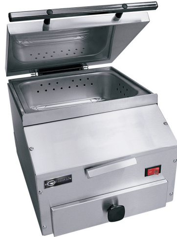
Manual Operation Steamer with Water Pan

Tap Water Operation Designed to Operate Without Distilled Water Self Contained Water Supply