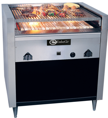
Floor Model - 41F Open Front

Installation and Service Manual - 8448-24 Date Code - September 1959 (Supersedes EMB28 Replacement Parts List for Open Hearth Broiler Model 41)