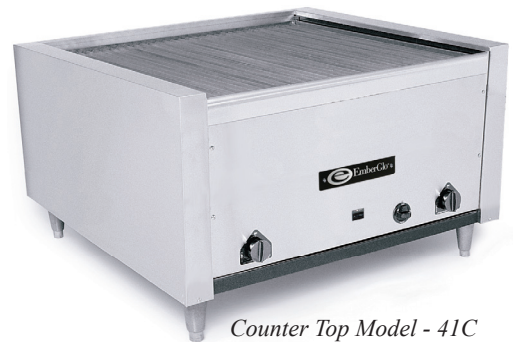
Counter Top Model - 41C Closed Front