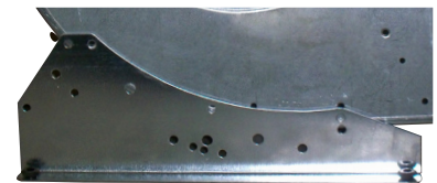
UNIVERSAL BASE FOR 4 POSITION DISCHARGE