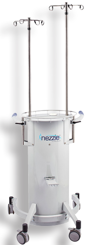
NEZZIE JR. #NZ9100

DIMENSIONS AND WEIGHT: 27 13/16" (width) x 26 3/8" (depth) Height of IV Poles: 52" - 83" Height of Handles: 33 3/8" - 38 7/8"