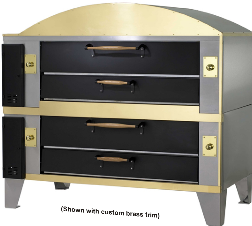
(Shown with custom brass trim)