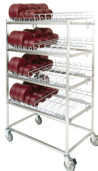
DRXLR Temp-Rite II excel & Ready Chill Storage rack