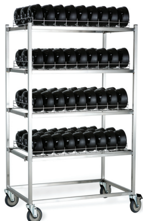
DR108S Allure Soup Dome Storage rack