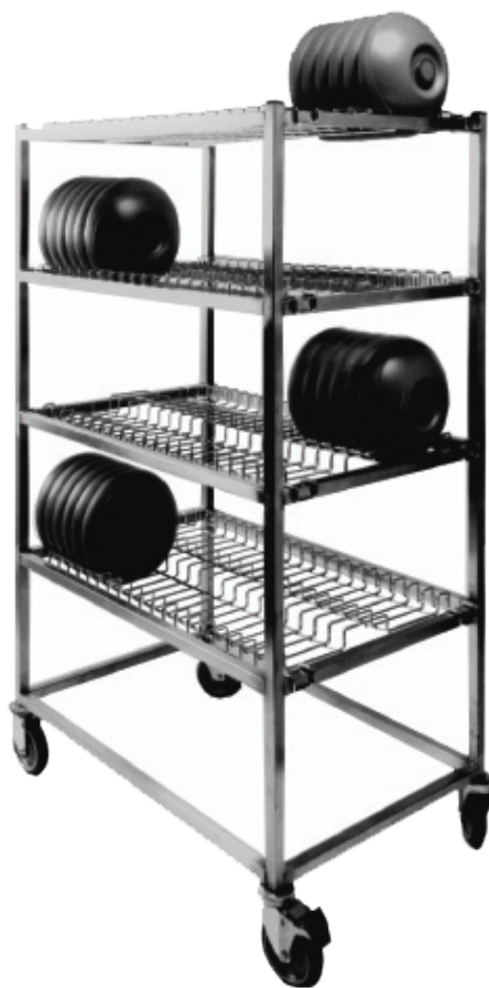
DR160E Allure Dome Storage rack