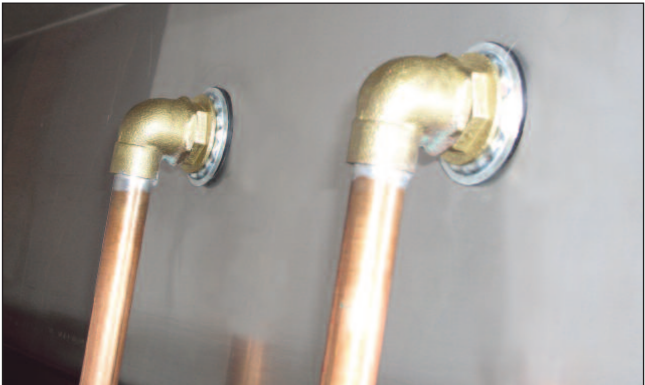
View From Back of Sink