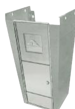
Add Trash Receptacle For 7-PS-33, 7-PS-37 or 7-PS-37B Only 7-PS-29

*Pedestal Base For 7-PS-20 and 7-PS-20-NF Hand Sinks 7-PS-37B