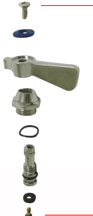
K-00 Replacement Kit