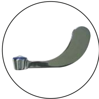
Wrist Handles Available K-316-LU