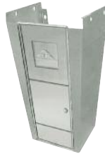
Add Trash Receptacle For 7-PS-33, 7-PS-37 or 7-PS-37B Only 7-PS-29

*Pedestal Base For 7-PS-20 and 7-PS-20-NF Hand Sinks 7-PS-37B