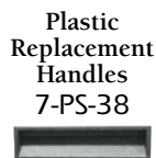
Plastic Replacement Handles 7-PS-38