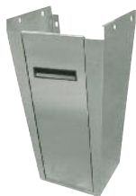
Pedestal Base Only 7-PS-37