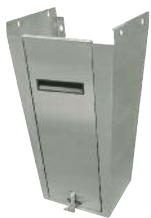
With Foot Valve 7-PS-33

For use with 10" x 14" Hand Sink Bowls* (Sinks Not Included)